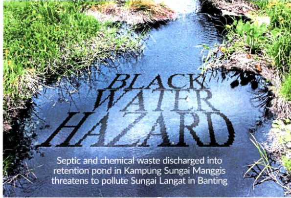
Septic and chemical waste discharged into retention pond in Kampung Sungai Manggis threatens to pollute Sungai Langat in Banting

By FARID WAHAB fahidwahab@star.com.my CONTAMINATION of Sungai Langat in Banting is threatening the daily water supply just as Selangor plans to revive water diversion caused by odour pollution in Sungai Congkak. This follows the discovery of septic and chemical waste being discharged into a water retention pond in Kampung Sungai Manggis, located some 15km from the river. A check by StarMetro revealed that the water there had turned black, emitting a stench. Dead fish floated on the pond's surface, while aquatic plants had withered, as dirty water flowed into Sungai Langat through an under-ground culvert. This area is about 500m from the Kuala Langat Drainage and Irrigation Department (DID) office. Locals claim a nearby factory's