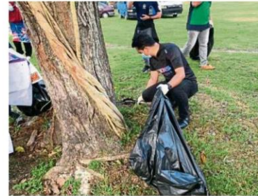
A resident picking up rubbish and plastic bottles during the gotong-royong at the area surrounding Taman Kem low-cost flats in Port Klang.